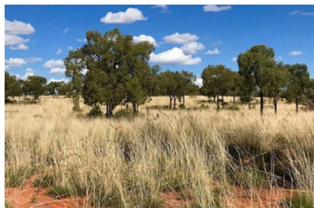
Figure 1. Examples of rangeland landscapes – sheep grazing arid shrublands (left); tropical savannahs used for grazing beef cattle (right).