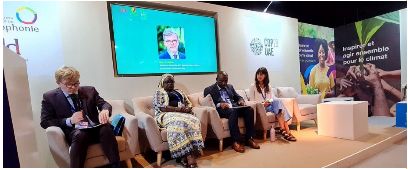
Marc Fesneau, French Minister of Agriculture, at the Cirad-IRD-4p1000 side event on the Francophonie Pavilion - COP28